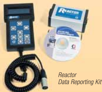
Reactor Data Reporting Kit